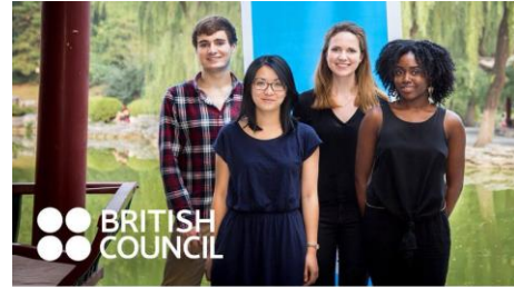
British Council Internships 2023 Fully Funded Internships in UK for One Year

British Council Internship Program invites those individuals who are either current students or have completed their studies. Those having desire to get hands-on experience in the international work environment by transforming their academic knowledge into real-life work are welcome to apply here. These internships will provide you with the tremendous opportunity to develop your professional skills in your relevant field within the short span of the British Council UK internship program. This will help open numerous avenues for you where you can learn more and have a better understanding of your chosen career.